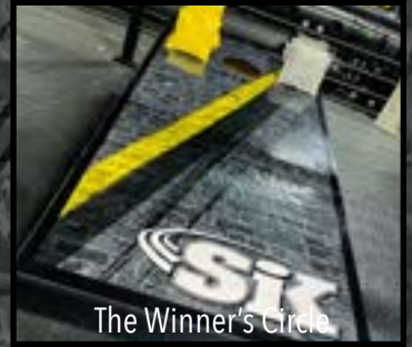
The Winner's Circle