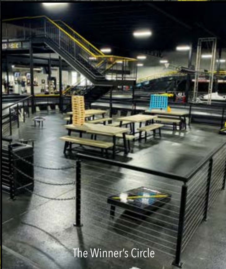
The Winner's Circle