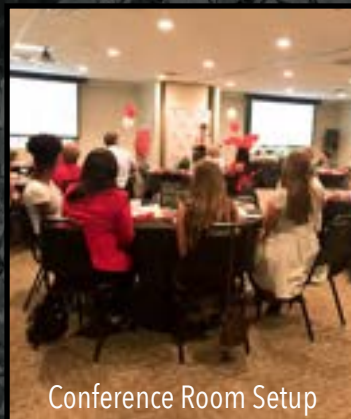
Conference Room Setup