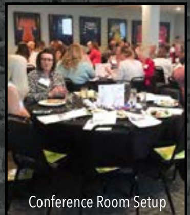
Conference Room Setup