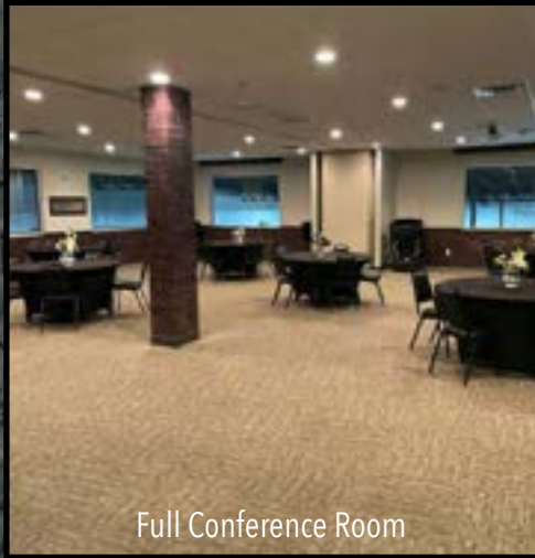
Full Conference Room