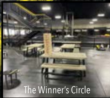
The Winner's Circle