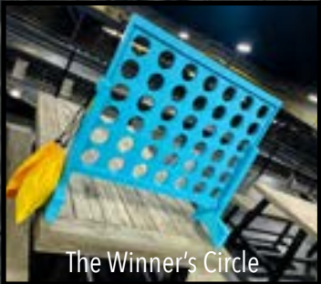
The Winner's Circle