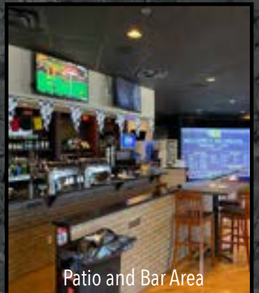
Patio and Bar Area