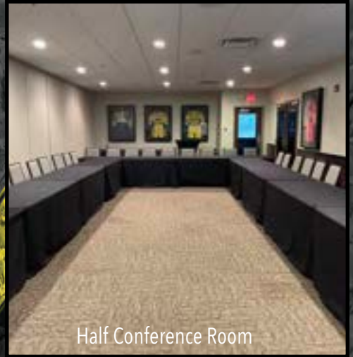
Half Conference Room