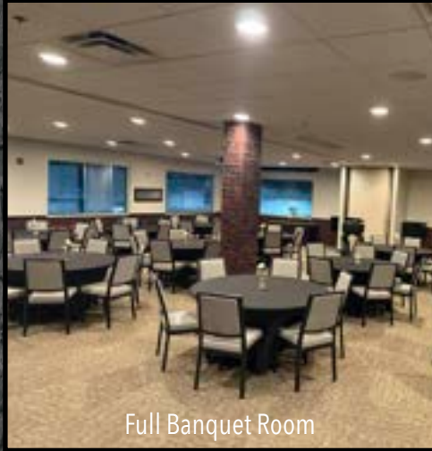
Full Banquet Room