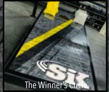
The Winner's Circle