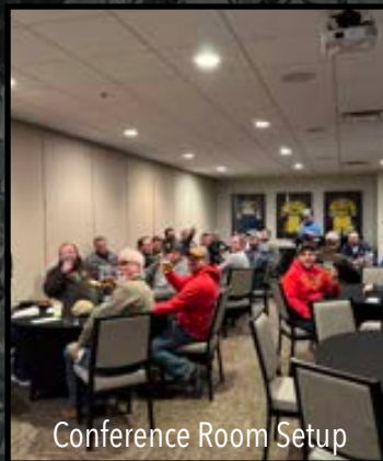
Conference Room Setup