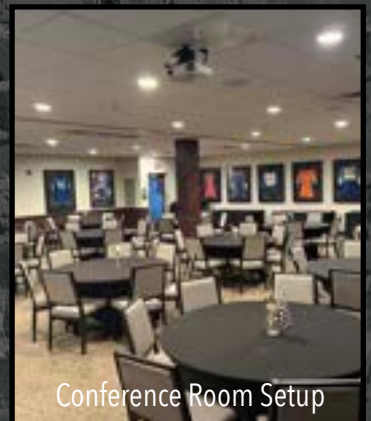
Conference Room Setup