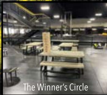
The Winner's Circle