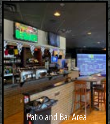
Patio and Bar Area