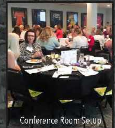
Conference Room Setup