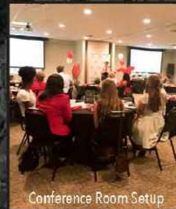
Conference Room Setup