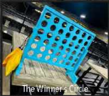
The Winner's Circle