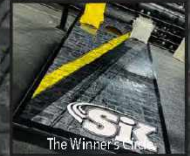
The Winner's Circle