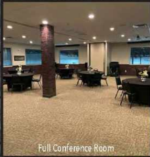
Full Conference Room