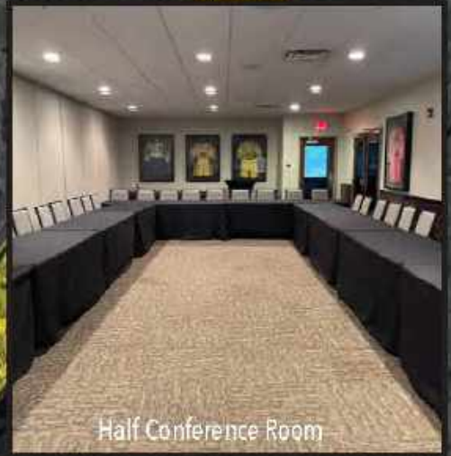
Half Conference Room