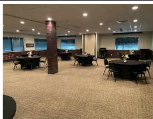
FULL CONFERENCE ROOM