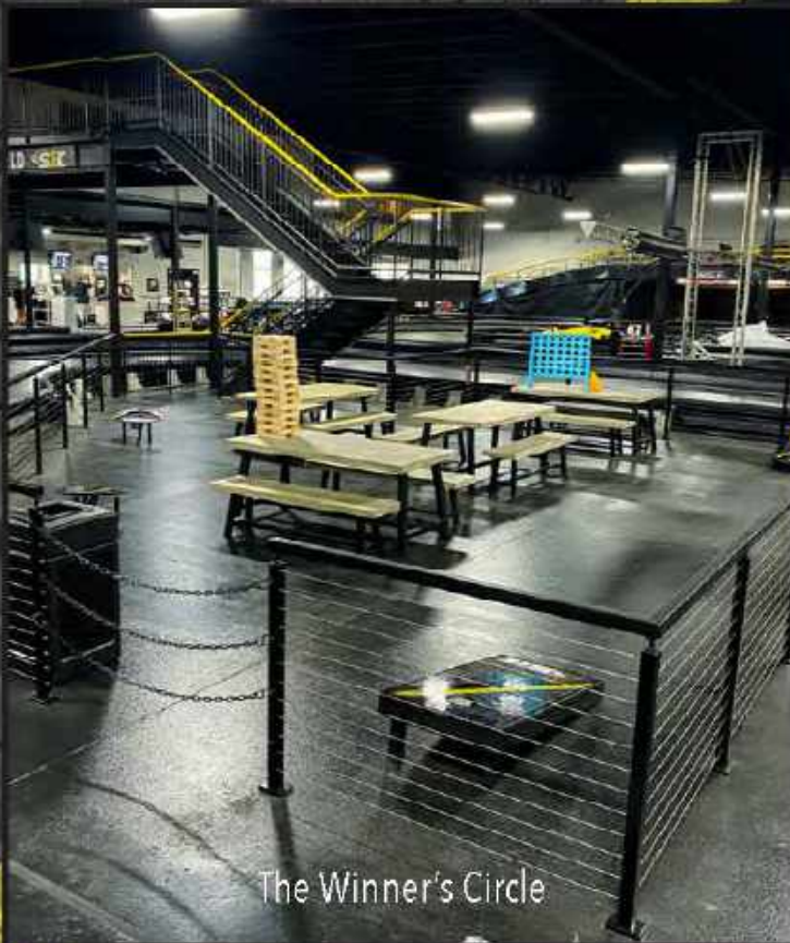
The Winner's Circle