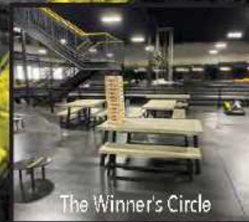
The Winner's Circle