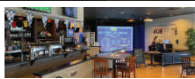
PATIO AND BAR AREA

**There is a $200 surcharge for the use of any confetti or glitter**