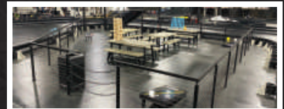
THE WINNER'S CIRCLE