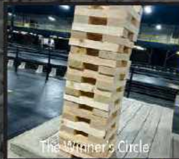
The Winner's Circle