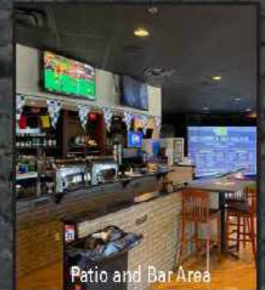
Patio and Bar Area